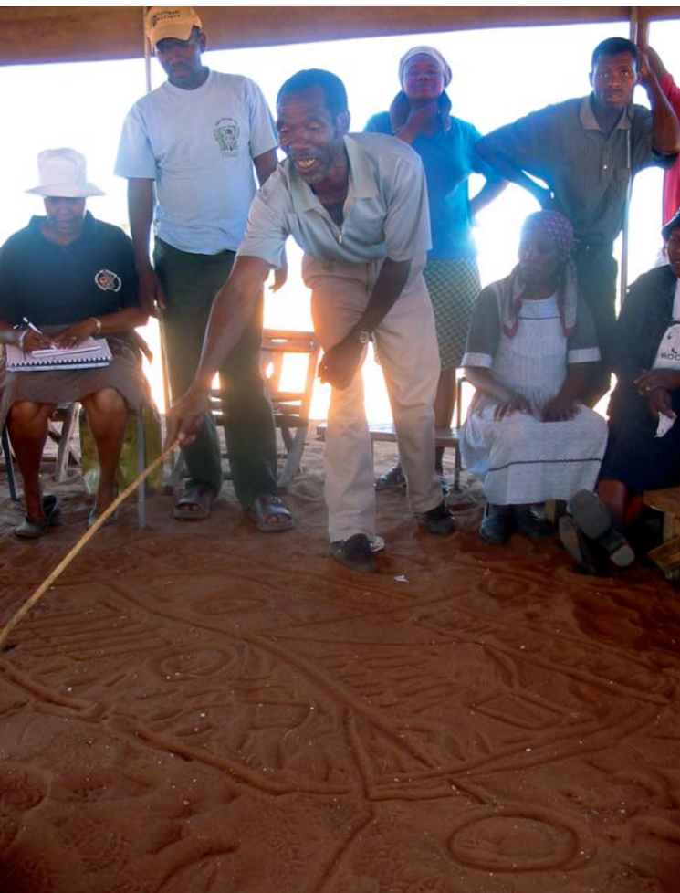
Participatory mapping by Bakgalagadi pastoralists and San hunter-gatherers in Botswana