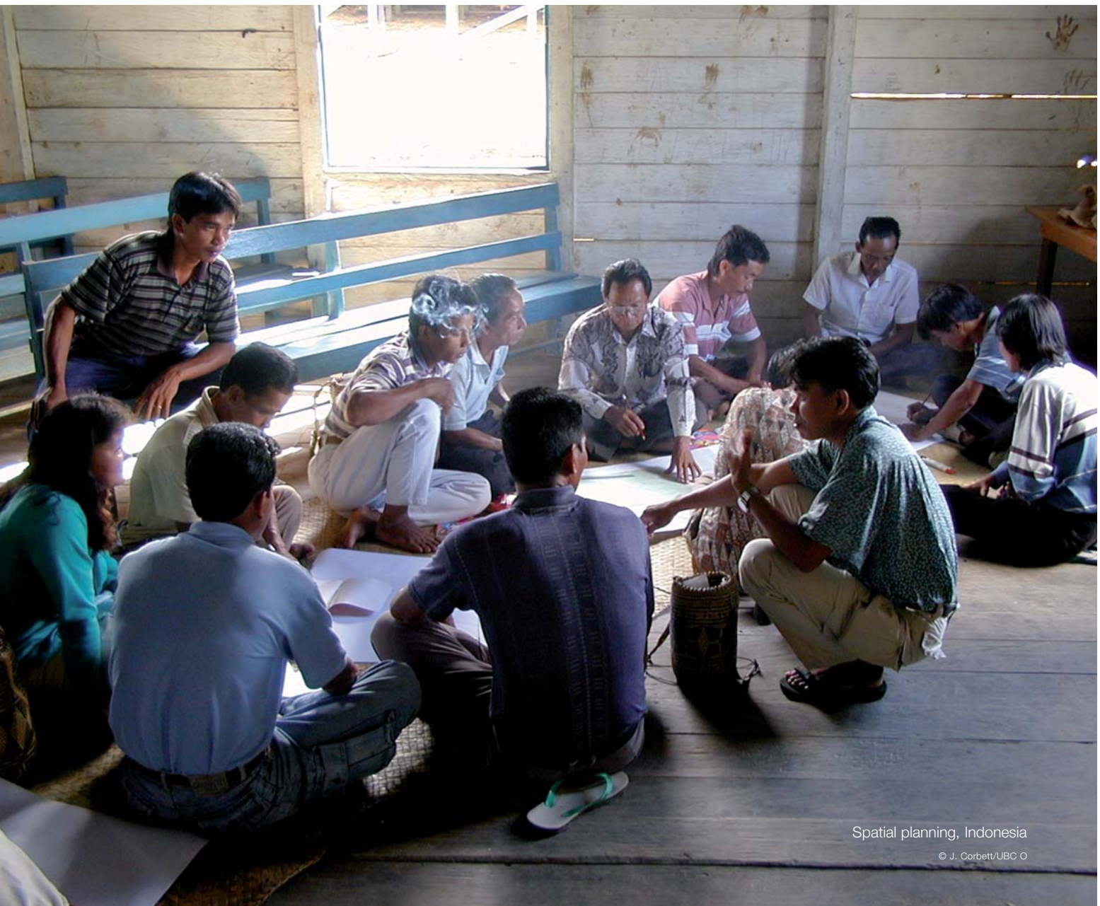
Spatial planning, Indonesia