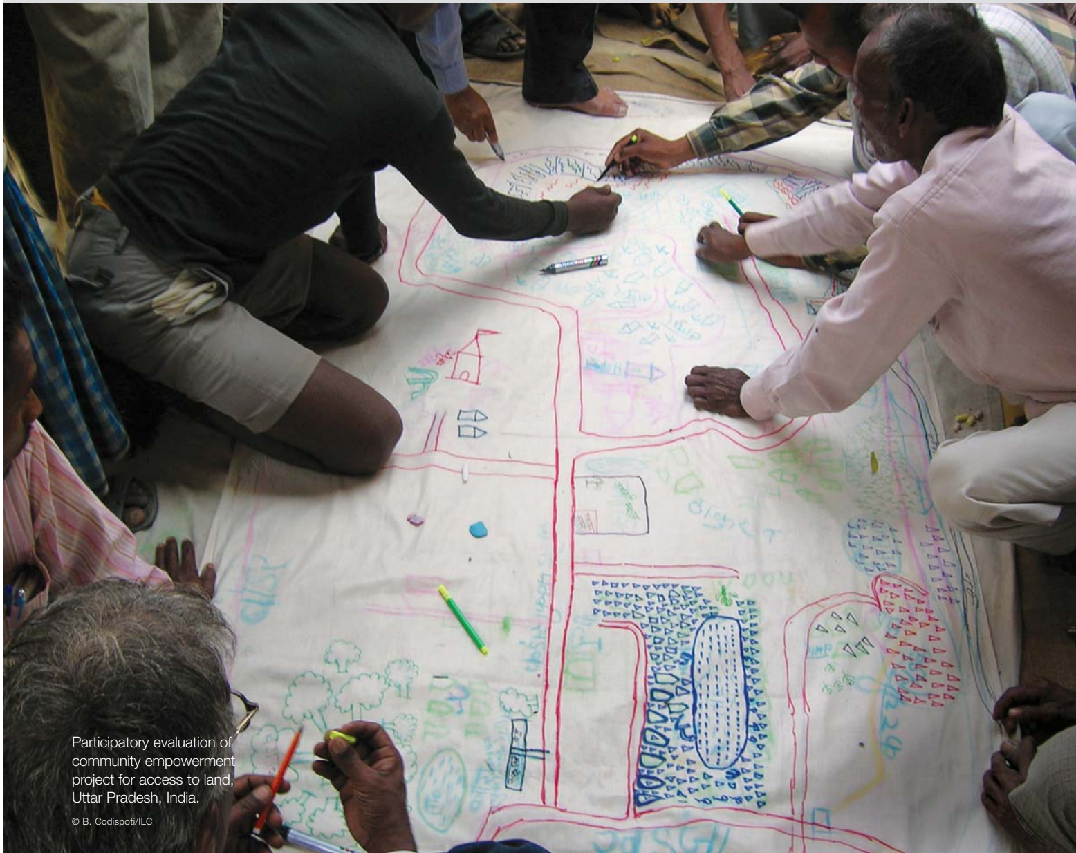
Participatory evaluation of community empowerment project for access to land, Uttar Pradesh, India.

Trust refers to the relationships between different groups and individuals. It is a critical ingredient for undertaking participatory mapping. Barbara Misztal (1995) writes that trust makes life predictable, it creates a sense of community and it makes it easier for people to work together. The need for trust appears to exert a discipline on practitioners. Without the appropriate behaviours and attitudes for developing this trust, participatory mapping practice is difficult indeed.