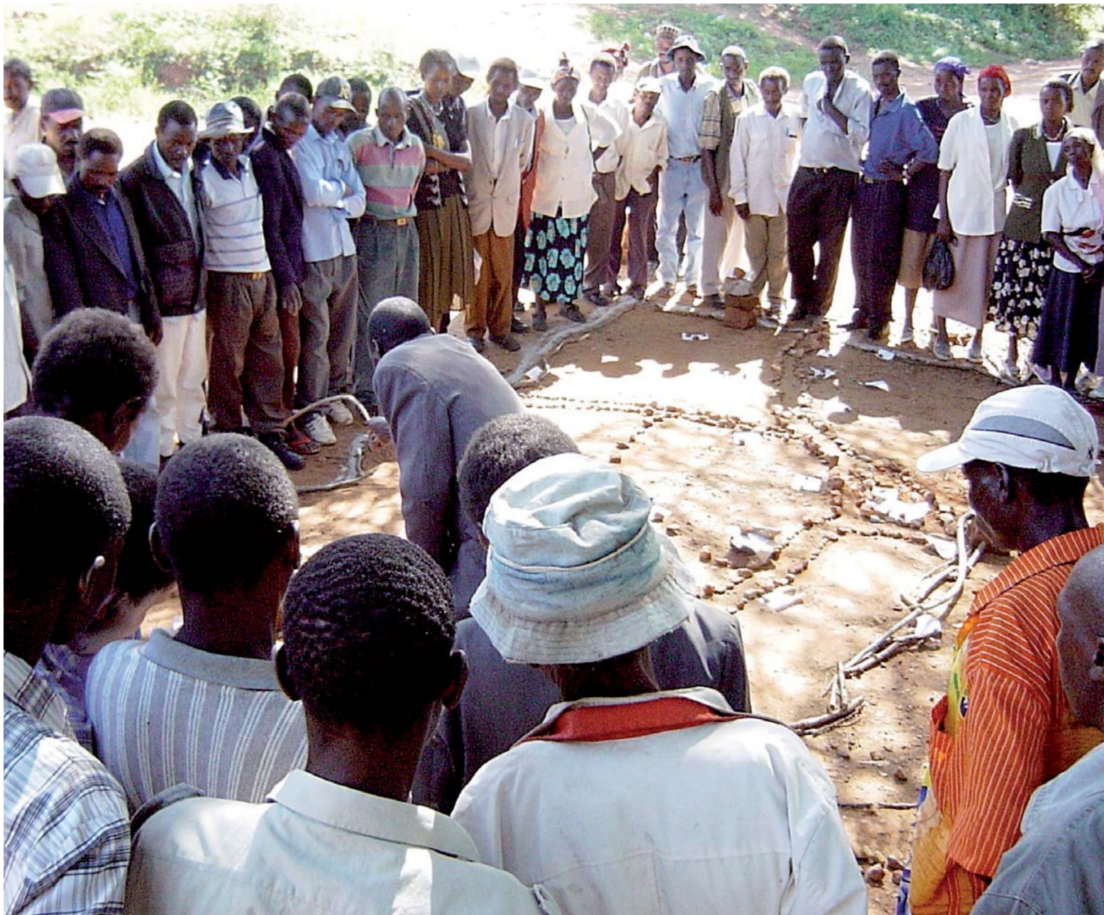
Community involved in ground mapping activity in IFAD Mount Kenya East Pilot Project (MKEPP)