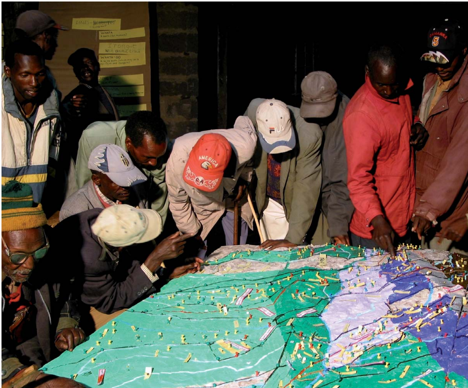
Ogiek Peoples visualizing their traditional lands using a physical 1:10,000-scale 3-dimensional cardboard model. Nessuit, Kenya