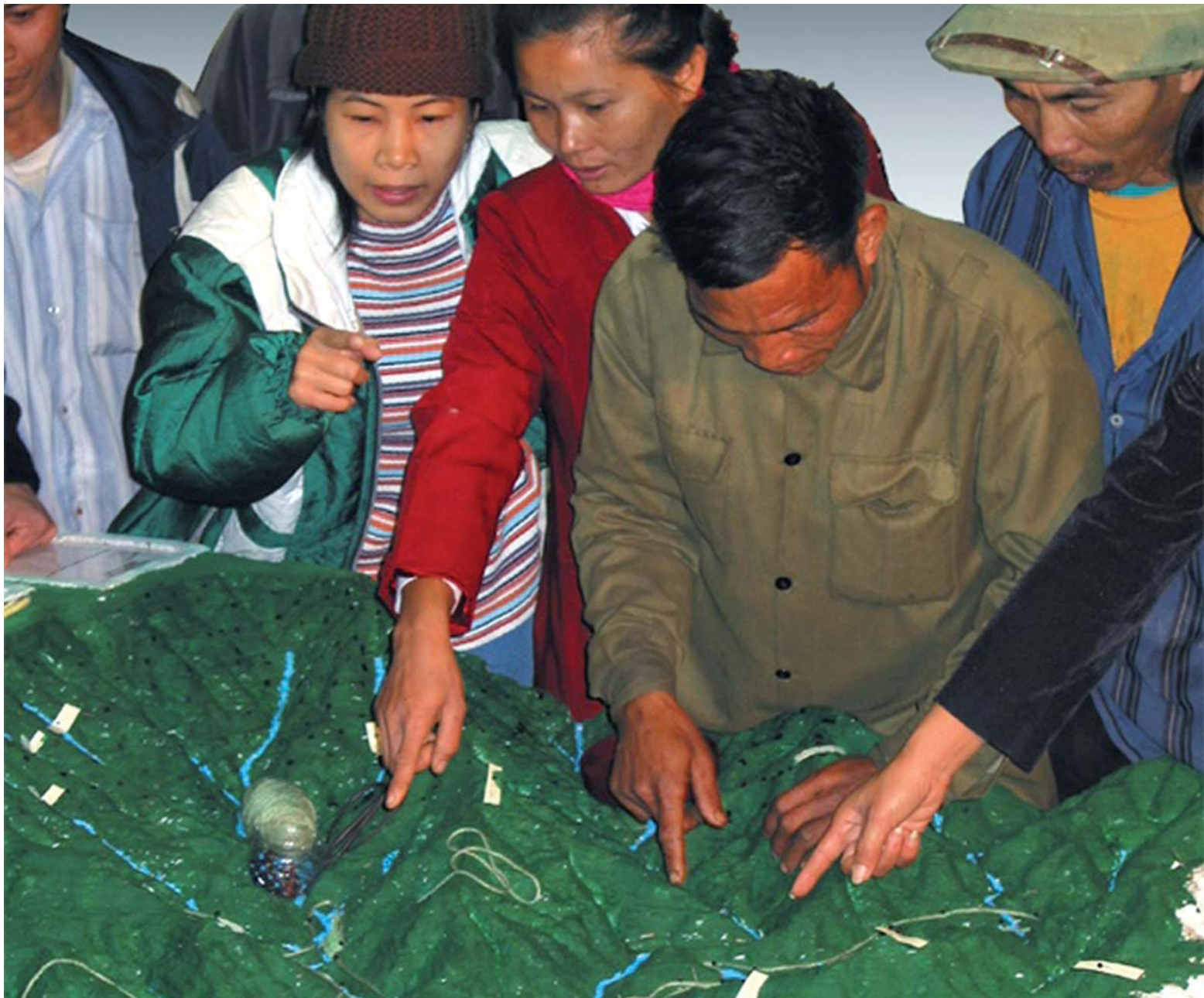
Participatory 3D modelling, Vietnam.